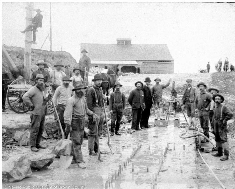
Unknown Brickyard (circa 1900's)