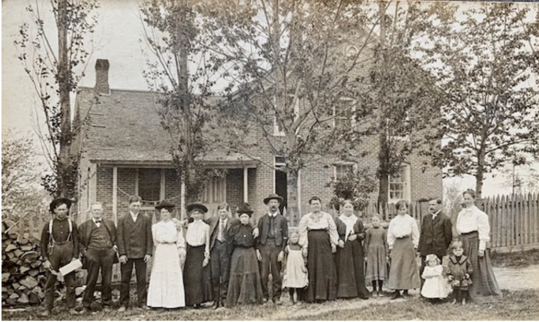
DeKaster Family Home (no longer exists but was located on County K just west of Champion School)

Photo taken about 1907